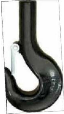
RSN Nr: 006 -40 arası kancalar için